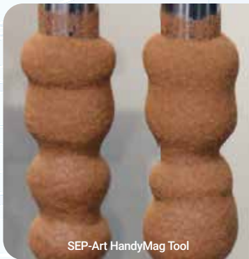
SEP-Art HandyMag Tool